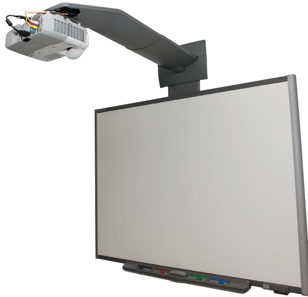
Projector, mount and whiteboard are not included.

1 SmartWay is an innovative partnership of the U.S. Environmental Protection Agency that reduces greenhouse gases and other air pollutants and improves fuel efficiency.